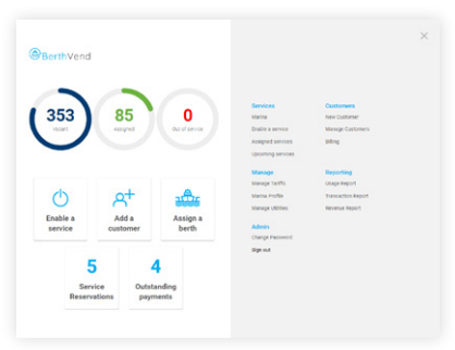
Menu Dashboard Screen

A hassle-free solution to bill groups of berth holders.