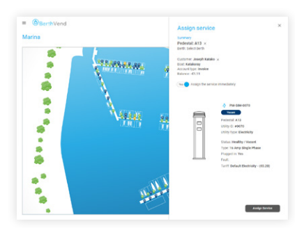
Assign Service Screen