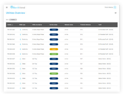
Utilities Overview Screen